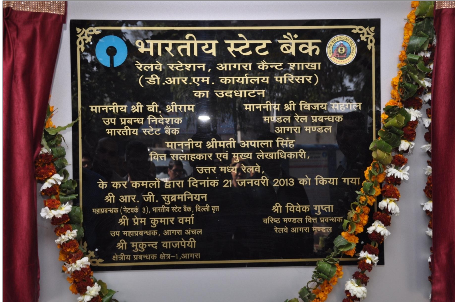
Inauguration of Bank in DRM premises