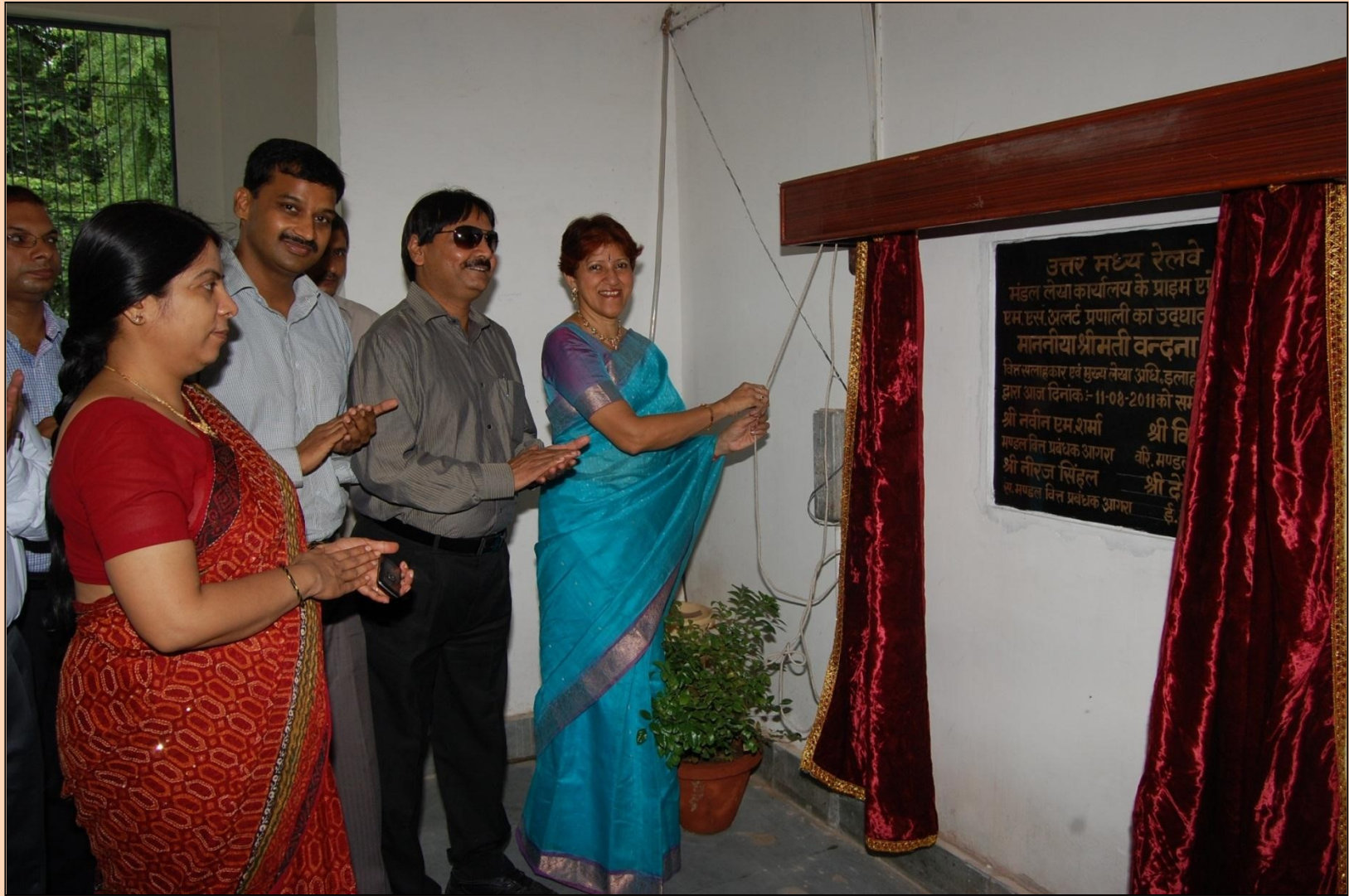
Inauguration of SMS ALERT system