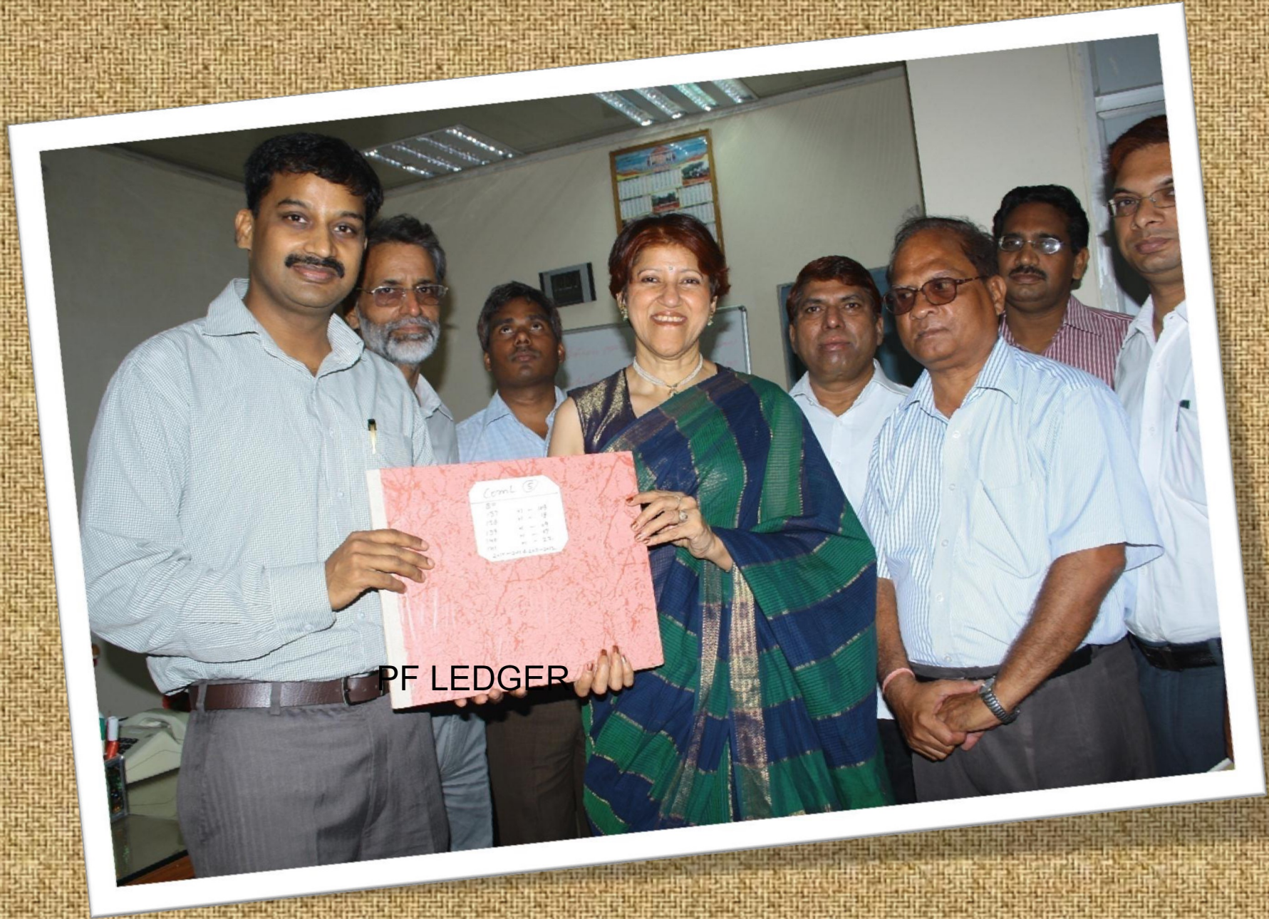
Starting of New PF ledger