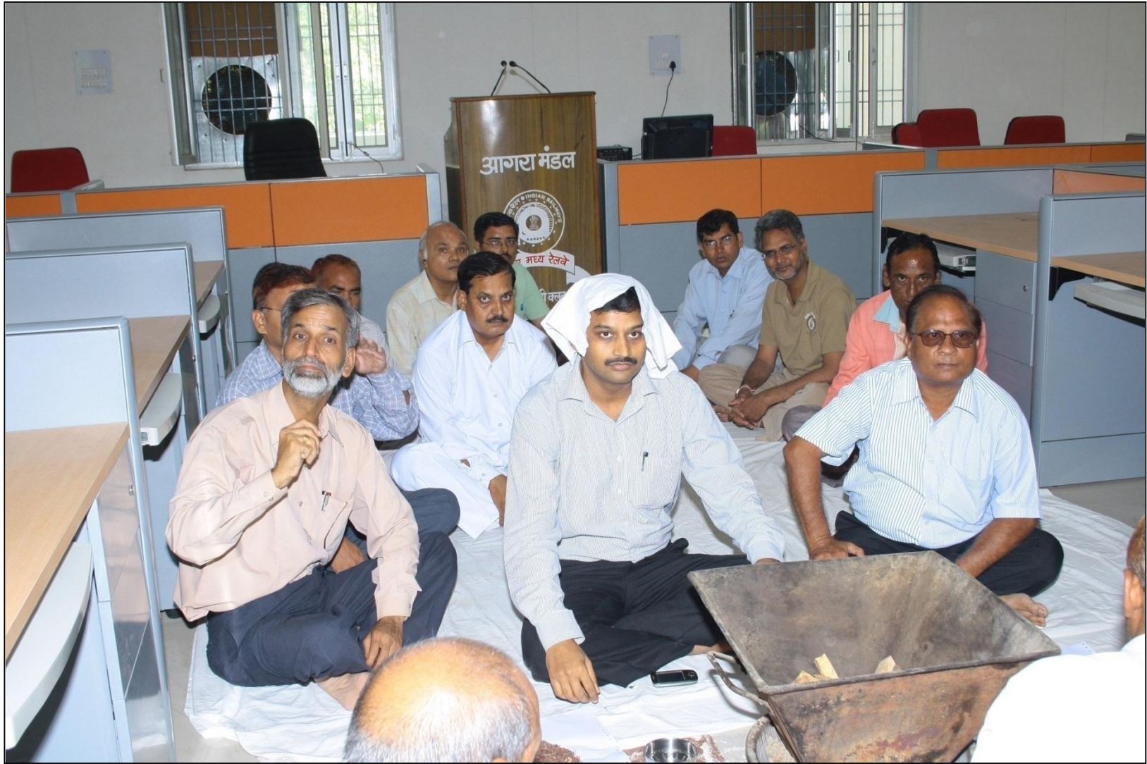
PUJA in New Accounts Hall