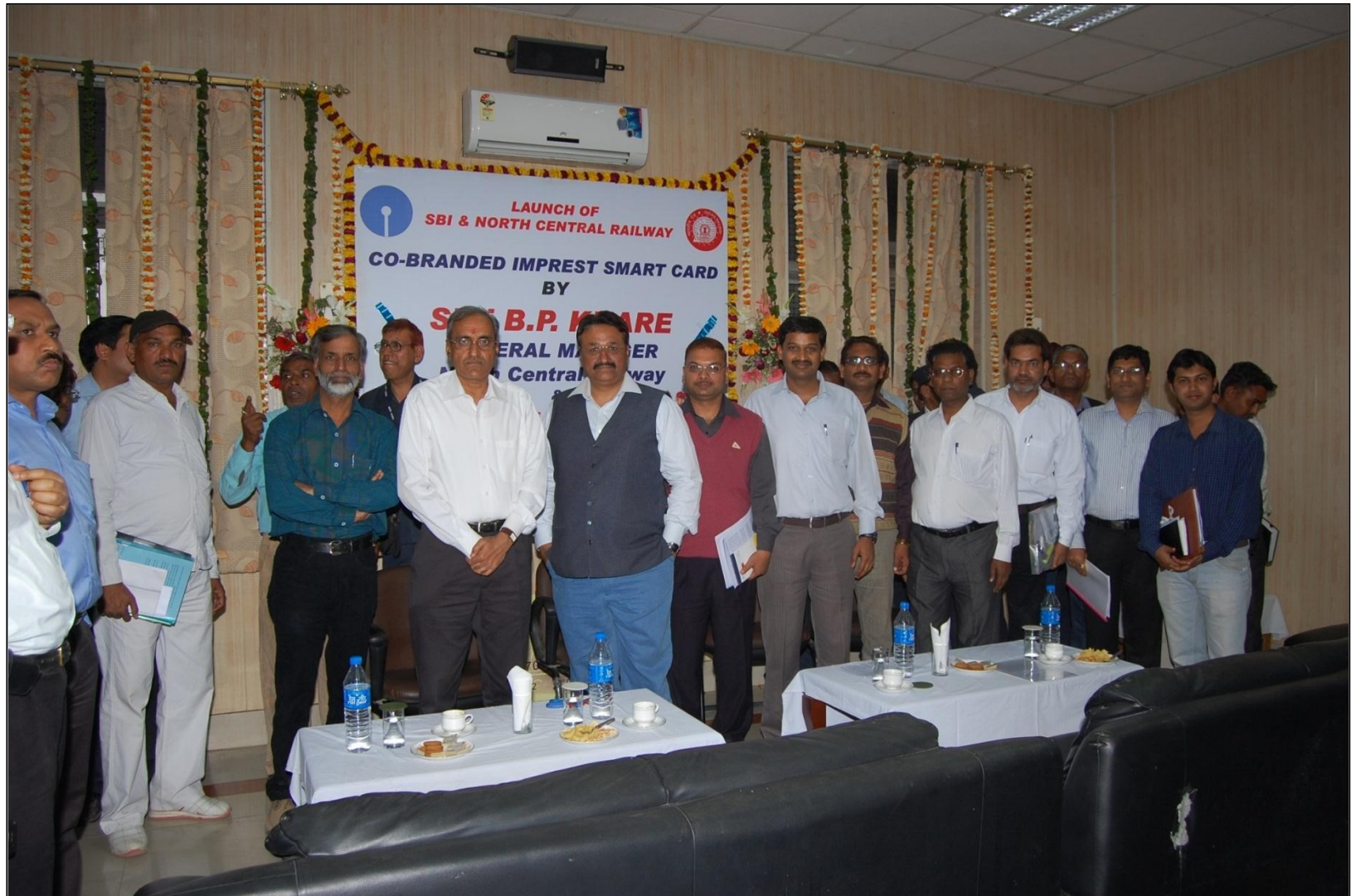
Group photo with GM/NCR while launching of IMPREST card at MTJ