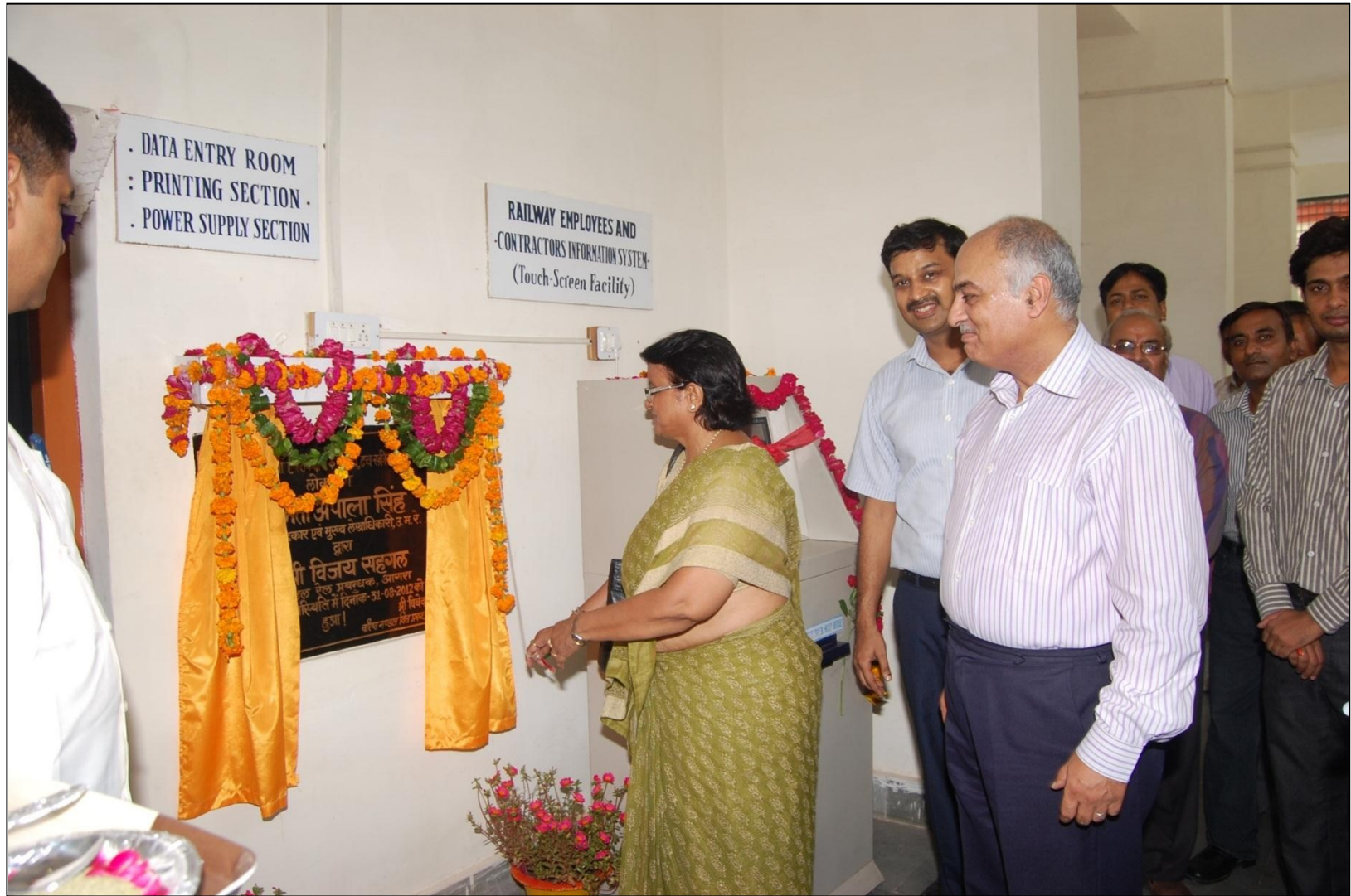
Inauguration of Touch Screen Machine with Print Out facility in Accounts Building