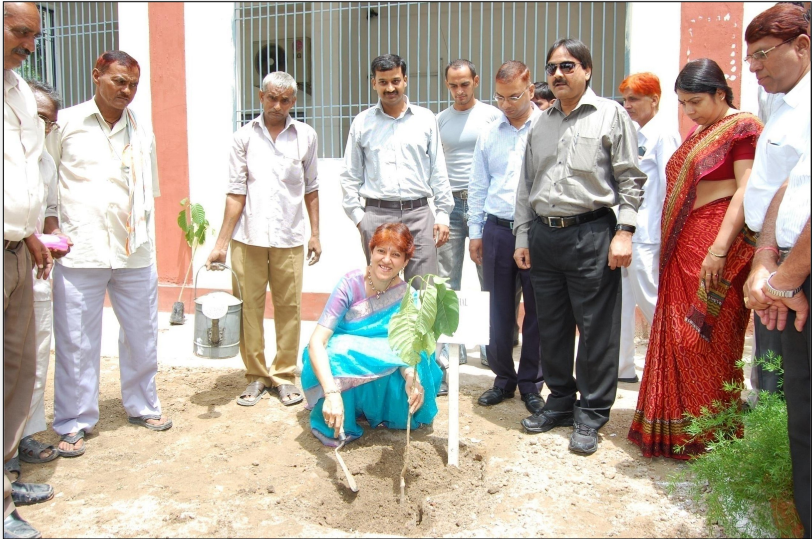
Plantation in Accounts office