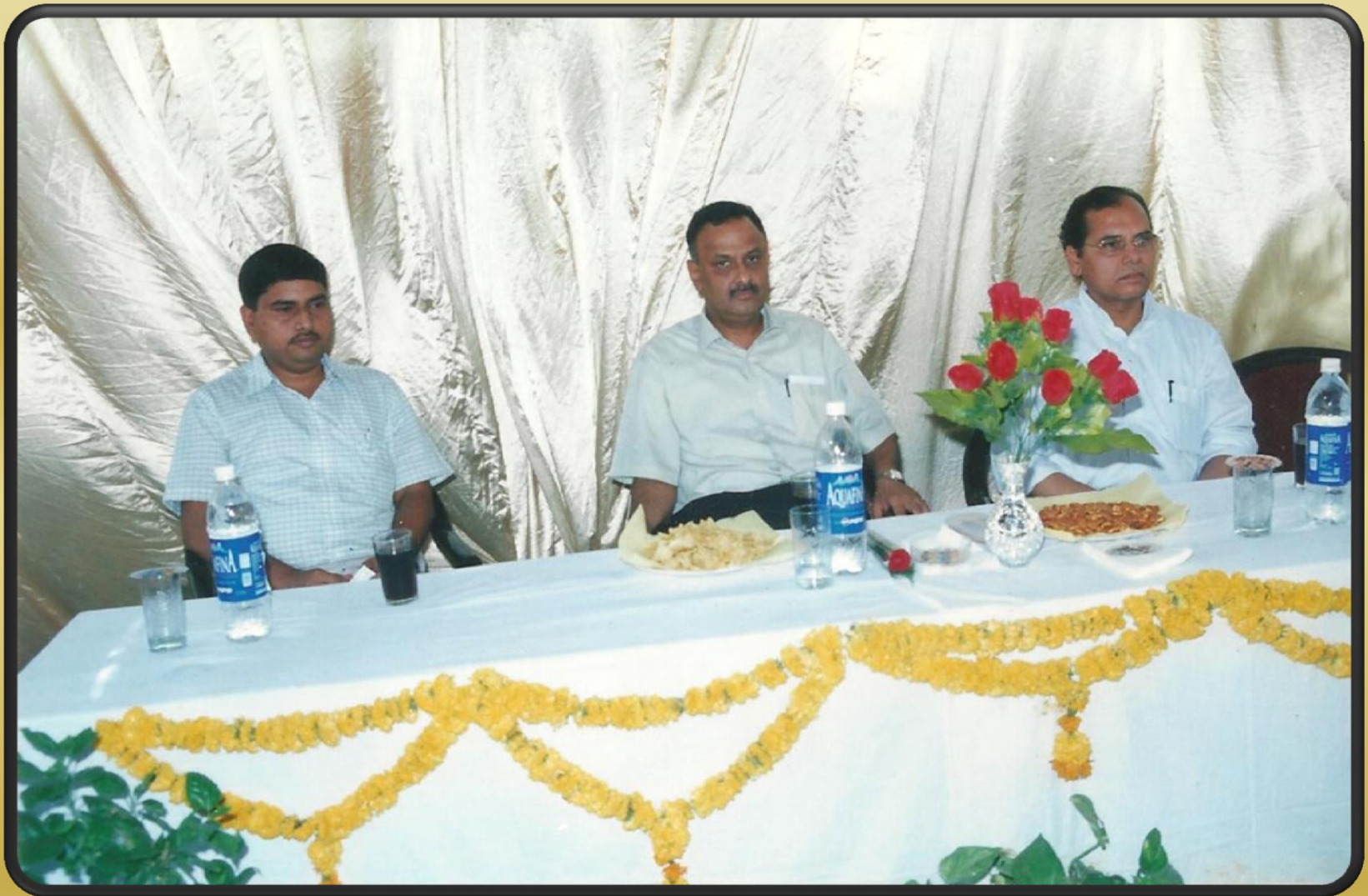
1 st Shield celebration in A/cs Deptt..... 2003-04