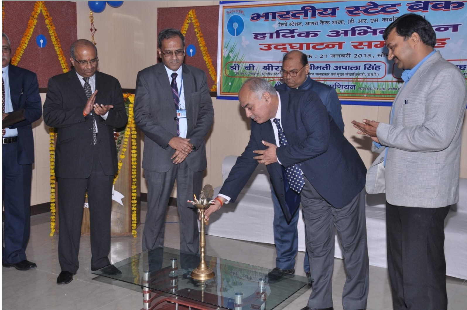
Lightning the Lamp by Shri Vijay Sehgal, DRM/Agra